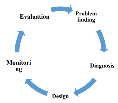
Figure 2: Phases of intervention cycle

Evaluation: To assess the effects of the implementation of a plan or intervention: is the problem actually solved.