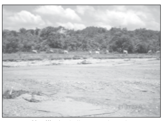
Siwaliks / Jaladh river- Dhanusha

The major environmental problems in Nepal are caused by land degradation, deforestation and pollution. Poverty is the root cause of environmental degradation. Land and forest resources are over-exploited because of heavy dependence in the natural resource base, while water and mineral resources are under-utilized owing to lack of financial resources and infrastructure. Soil erosion, fertility decline, sedimentation and floods have degraded and continue to degrade the land.