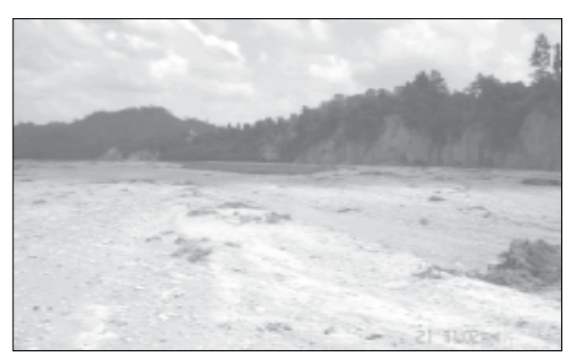
Flood affected area

As a pilot program of river bank conservation at the site with the involvement of the local people, the