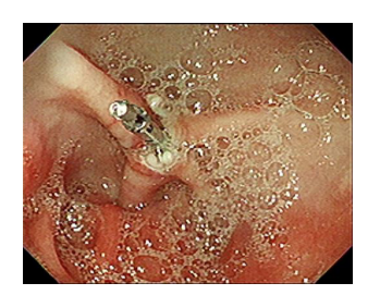
Figure: Endoscopic mucosal resection (EMR) of gastric dysplastic lesion by band ligation technique Submucosal injection of 10 ml of Normal Saline along with Epinephrine (1:10,000) and Methylene Blue was given in

the dysplastic lesion in the antrum in the pre-pyloric region