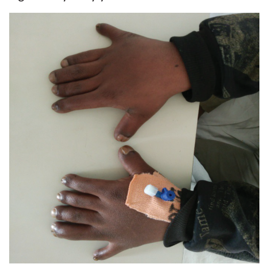
Fig 2: Polydactyly with nail dystrophy