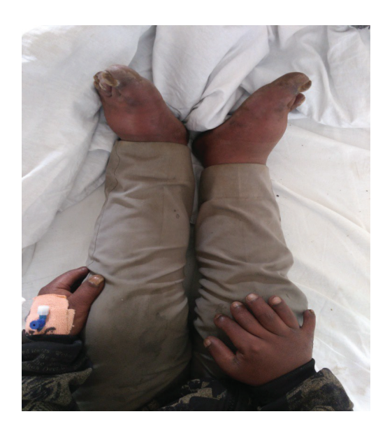
Fig 3: Limb deformity with genu valgum, talipus equinovarus