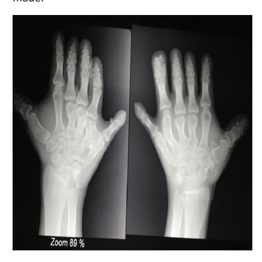
Fig: 1 Polydactyly

venous pulse (JVP) was elevated with prominent 'a' wave. The patient had long and narrow appearing thorax with a precordial bulge. There was cardiomegaly, with apex beat at left 6th intercostal space, 4cm lateral to the mid-clavicular line. Grade III/III left parasternal heave was present. The first heart sound was loud; the second sound was widely split and fixed. The pulmonary component was loud. There was a grade 3/6 pansystolic murmur with inspiratory accentuation audible at left lower sternal border. Chest X-ray revealed cardiomegaly with right atrial enlargement while his ECG revealed normal P wave axis and right axis deviation, p' pulmonale with RVH. His echocardiographic examination revealed situs solitus, enlarged right ventricle and a common atrial chamber without any interatrial septum (Fig. 5) . The right and left components of the common AV valves were at the same place with evidence of regurgitation through both the components of the valve. There was evidence of pulmonary arterial hypertension (PAH) in the form of right ventriculo- atrial gradient of 89 mm Hg . A diagnosis of common atrium anomaly with severe PAH was made.