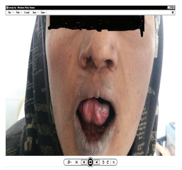
Fig 4 : Oromaxillary defect with dental malocclusion, ankyloglossia