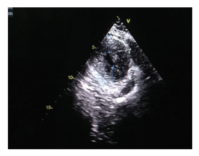
Fig 3 : Short axis echo view showing hypertrophied LV apex ( anterior 20mm, posterior 20 mm )