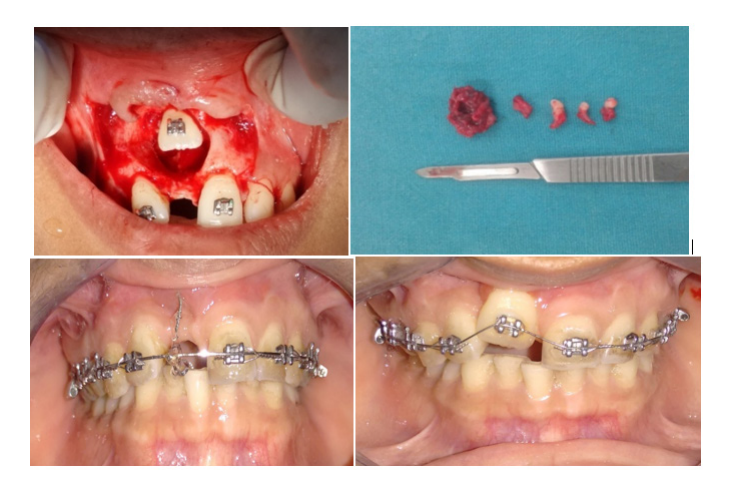
Figure 2: Surgical phase and orthodontic treatment