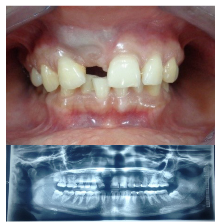
Figure 1.Intraoral photographs and OPG