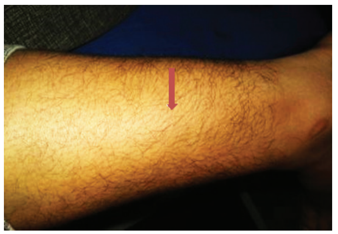
Figure 2. Swelling of the posterolateral aspect of distal third of the left leg.

only on careful inspection but the skin over the swelling was normal. Tenderness was localized on the posterolateral aspect of the left distal leg approximately 8 to 10 cm proximal to the ankle joint. Deep palpation revealed a globular, non-pulsatile swelling of 4x5 cm with indistinct margin and swelling was non adherent to the skin and lying deep in the muscle (Figure 2).