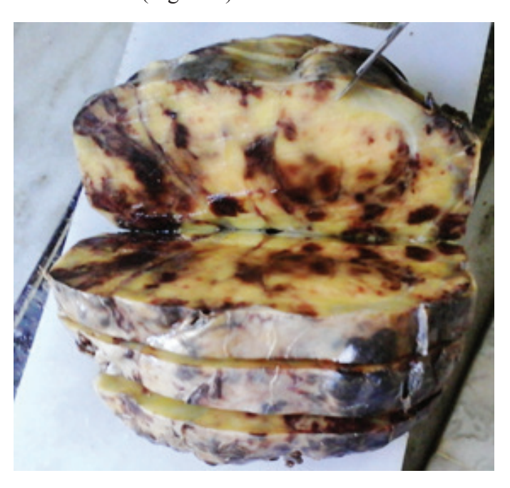
Fig 1: Gross finding showing yellow fatty areas and hemorrhagic areas.

well. On Gross examination there was a well defined mass with smooth outer surface. Cut sections showed yellow smooth areas along with foci of hemorrhage (Figure 1). Cystic changes, myxoid changes or necrosis were not present. Multiple histological sections revealed mixture of mature adipose tissue along with hematopoietic elements without cellular atypia (Figure 2). These hematopoietic elements comprised of myeloid and lymphoid elements along with megakaryocytes. There was a thin rim of adrenal tissue as well (Figure 3).