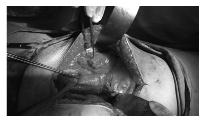
Fig-2: Operative image of the cyst

the psoas muscle without any dense adhesions with it. However, mass was densely adherent posteriorly impairing the dissection. So, the cyst was opened after placing the hypertonic saline soaked gauges around it. All the contents including the daughter cysts and germinative membrane were evacuated and scolicidal agents were put in the cavity. On further dissection the cyst was found to be densely adherent to the femoral nerve and the lumbar plexus of nerves. The redundant pericyst was excised preserving these structures.