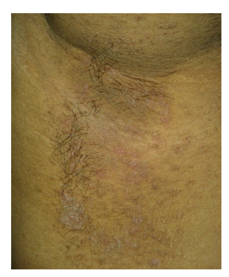
Figure 1a and 1b: Erythematous crusted plaques over nape and right axilla.