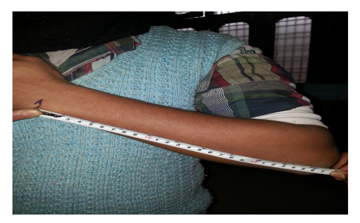
Fig 1: showing the measurement of ulna length in adult male participant. Tip of the olecranon process is marked as B and the ulna styloid process is marked as A.

In each case, the height of the person and length of right and left ulna were recorded. The measurements were always taken at a fixed time, between 3-5 PM, to eliminate discrepancies of diurnal variation. Measurements were taken for stature from crown to heel in standing erect posture with head oriented in Frankfurt's plane with a standard height measuring instrument. The height of participants was recorded in centimeters. The length of ulna was measured with the help of measuring tape from tip of olecranon process to tip of styloid process with elbow flexed and palm spread over opposite shoulder. (Fig:1) Measurements of length of right and left ulna were taken separately for calculation. The obtained values were analyzed by using the SPSS, version 12.0 software. The prediction of a significant relationship amongst the pair of variables was determined by the "Correlation coefficient" i.e., Pearson's 'r'. The relationship between the changes of a dependent variable (say, y) and an independent variable (say, x) was ascertained by simple linear regression, with the "Regression coefficient (b)"; where the model of the regression equation was y = a + bx [where a = yintercept, when x = 0]. As in every equation; a 95% confidence interval (which was equivalent to 1.96 standard deviation) was accepted and the standard error of regression (STE) was calculated. The final equation model was y = (a + bx) \pm (1.96 \times STE) .