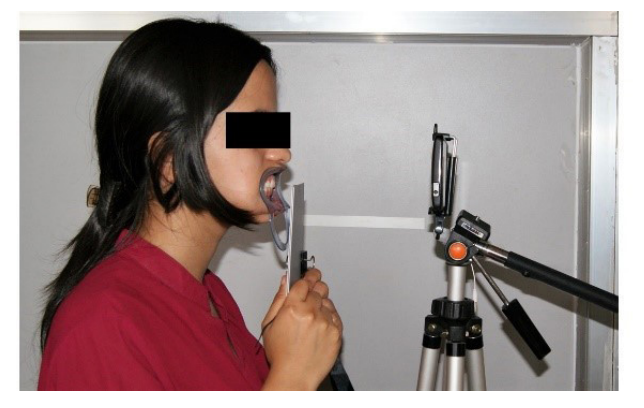
Figure 2: Picture taken with mobile phone camera

To ensure standardization during the study, all the pictures were taken directed toward northern facing sunlight. The pictures were taken in daylight on a clear day.