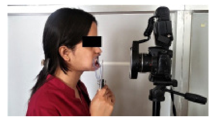
Figigure 1: Picture taken with DSLR camera and ring flash

was taken without altering the position of the patient without flash and again with flash (Figure 2).