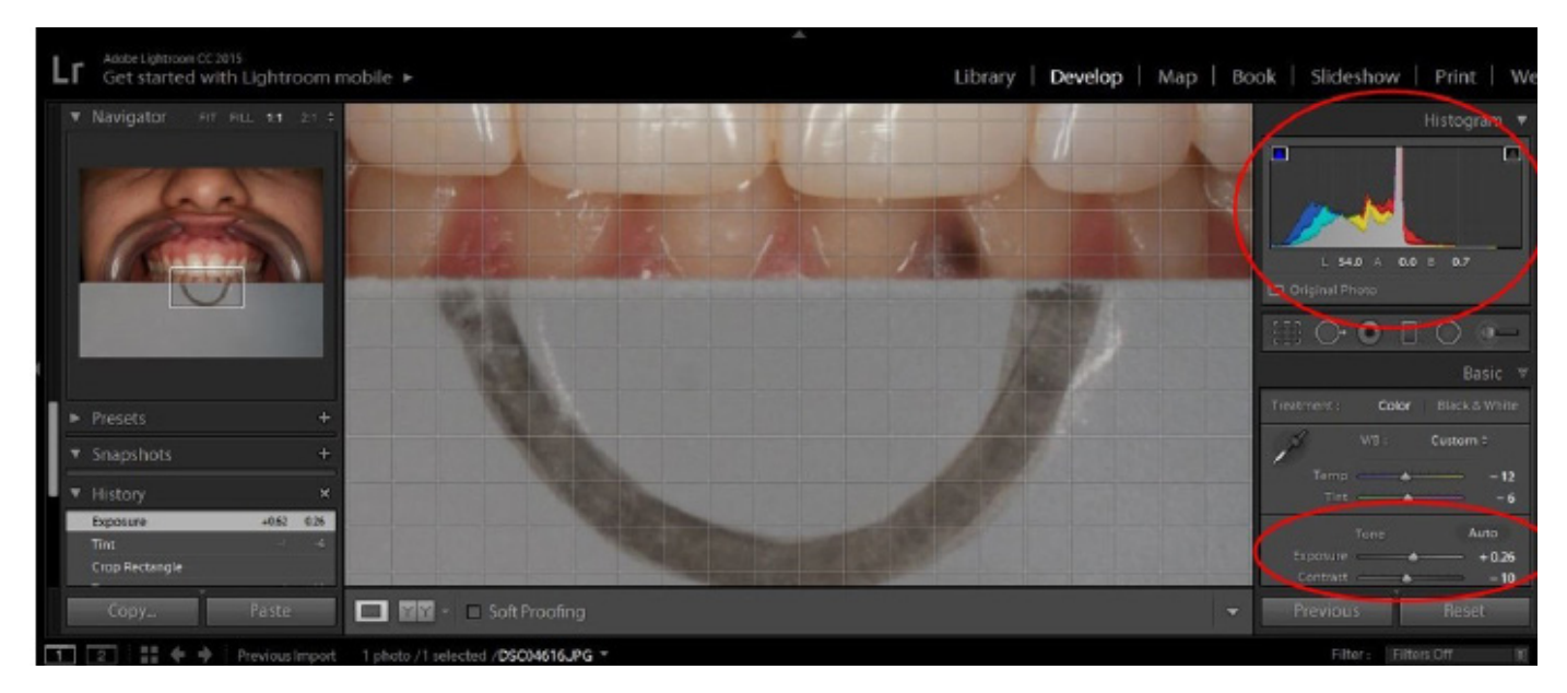
Figure 4: Adjusting exposure to bring the L*a*b* values as close to 54,0 and 0 as possible