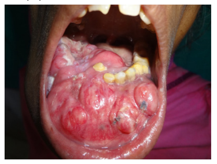
Figure 1: Picture showing intraoral view of osteosarcoma

The patient was thin built, sitting comfortably in bed and was well oriented to time, place and person. Her all vital parameters were in normal range. On clinical examination, The swelling was located on mandible measuring 6x4 cm in size with multiple nodules extending from left 2nd premolar to right side retromolar region, skin overlying the swelling was erythematous (Figure 1). There was no tenderness with normal temperature and texture. The lesion was firm to hard in consistency with irregular margin and multiple breaches in mucosa with obliteration of labial and lingual vestibule. Tongue movements were normal with paraesthesia of lip on the right side was noted. There was no cervical lymphadenopathy with adequate mouth opening and TMJ movements were palpable.