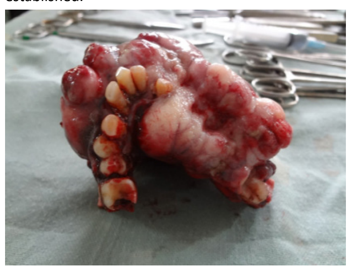
Figure 4: Tumour after resection

grade), intra compartmental anatomic location of the tumour was diagnosed and treatment plan was established.