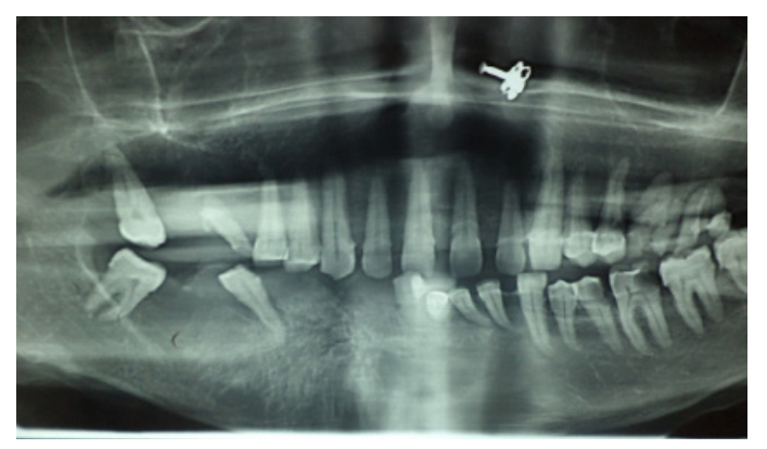
Figure 2: showing sunburst appearance of the right jaw adjacent to the first premolar

of left 2nd premolar and was edentulous with only 2nd premolar and first molar on right side (Figure 2). Bone scan shows abnormally increased uptake of radionucleotide in lower jaw region and focal area of abnormal increased uptake of radionucleotide in right femur (Figure 3).