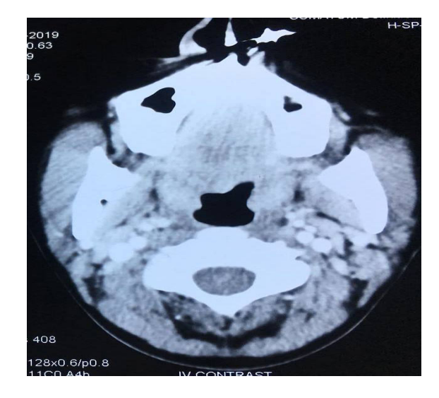
Figure 1: CECT of neck showing solid cystic lesions in left parotid space

a scar mark of previous surgical procedure in left post auricular region. On palpation 3-4 non tender, cystic swelling of about 1 cm x 1 cm in size was found in the left retro mandibular area. The facial nerve function was intact. The CECT of neck showed