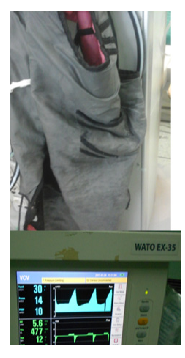
Figure 1: Lead apron covering exhaust valve causing increase of peak airway pressure.

This was one of the unusual causes of malfunction of the ventilator that we encountered, which was reported to department critical incident recording system.