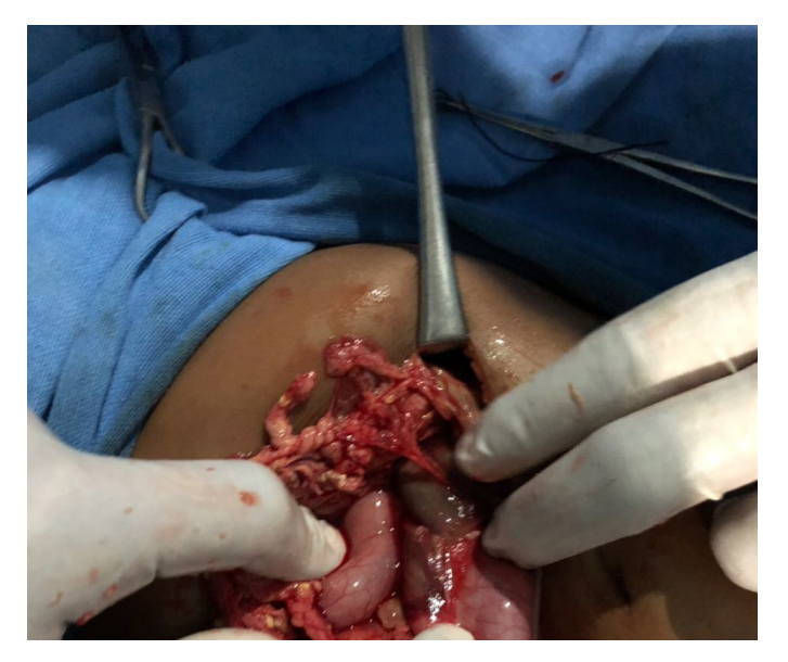
Figure 1: Calcification of mesenteric and omentum

Upon entering the peritoneal cavity, about 500ml of reddish fluid was encountered and was drained. There was multiple calcification in the omentum and mesentry (Figure 1).