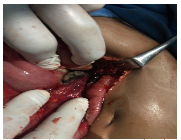
Figure 2: Necrotizing mass between transverse colon and stomach

Gall bladder and CBD were free of worms but few worms were noticed in the proximal jejunum that were milked into the large intestine. Upon entering the lesser sac, a necrotic mass of 4x4cm was seen along the stomach bed ensuring a mass effect on the stomach & transverse colon (Figure 2). The mass was arising from the tail of pancreas. The Necrosectomy was done and drains were placed in the lesser sac, retroperitoneal space and in the pelvis after thorough peritoneal lavage.