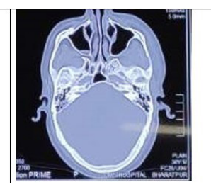
Figure 3: Pre and post CT scan of the isolated zygomatic arch fracture