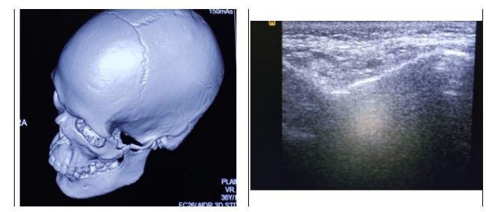
Figure 2: CT scan and intraoperative USG finding of isolated zygomatic arch fracture

Ultrasonography, with USG machine (Mysona U6 Samsung made in Japan), of the zygomatic arch was done at frequency of 10Hz. Ultrasound jelly was placed in a folded sterile surgical gloves. Linear transducer probe (LN 5-12) was kept and secured in the sterile folded glove. The entire unit (probe with covering glove) was dipped in betadine solution. Probe was placed over the malar prominence and ran along the arch visualizing the