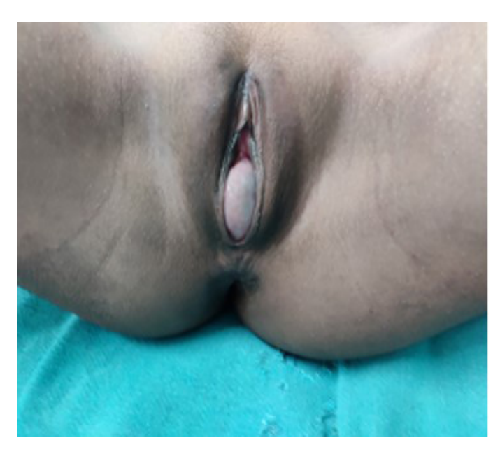
Figure 3: Images demonstrating the oval bulge of Hymen

confirmed as hematocolpometra with imperforate hymen (Figure 3).