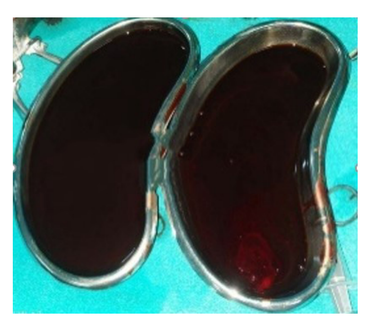
Figure 5: Tarry color blood