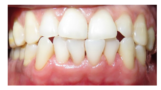
Figure 5: Post-operative clinical photograph

The wound healing was uneventful without any postoperative complications. At the end of 1 month, reepithelialization was completed. Six months postoperative examination revealed well-healed gingiva which can be defined as epithelialized tissue, which was pink in colour and pleasant as depicted in Figure 5. The patient was also fully satisfied with the clinical outcomes.