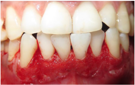
Figure 3: Intra-operative photograph

The entire pigmented epithelium along with a thin layer of connective tissue was removed (Figure 3).