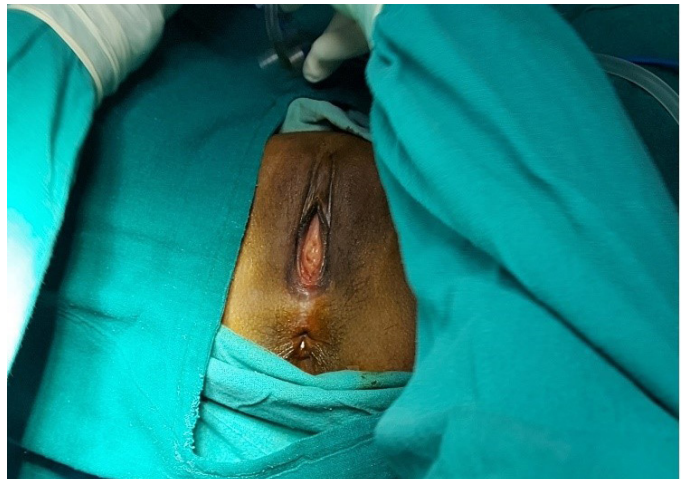
Figure 1: Dimple seen over the vagina

The patient was kept in a lithotomy position. After painting and draping Foley's catheterization was done. In the meantime, a 7 cm mould was made from foam rolled over a small plastic rod from POP plaster which was then taped and covered with two sterile condoms inserted (Figure 2).