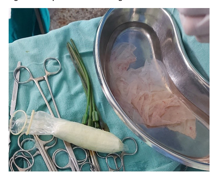
Figure 2: Preparation of mould and amnion

A transverse incision was made over hymen and a potential avascular space of 5 to 6 cm was created in between bladder and urethra above and rectum below with gentle digital and dilator manipulation (Figure 3). The amnion was mounted over the mould and its ends sutured so that amnion covered all parts of the mould. The amnion mounted mould was then inserted into the newly created vaginal canal gently so that amnion don't get damaged. The outer end of the mould was then sutured with the labia minora to hold the mould in place and to prevent expulsion (Figure 4). Post operatively patient was kept on antibiotics. Mould and the Foley's catheter was removed on day 10 of surgery. There was 4 to 5 cm of vaginal canal created with no blood clots or signs of infection. The amnion lining had been taken up and the cavity was gently cleaned. A newly made well lubricated mould was then inserted and the patient was discharged with the advice to follow up every fortnight. Patient was taught to remove and reinsert the mould at the