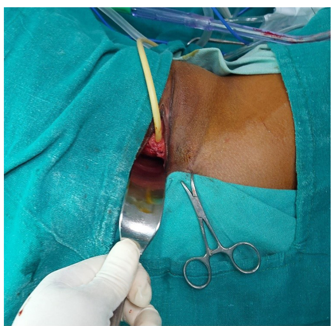
Figure 3:Creating neovagina from potential space

time of bladder and bowel evacuation. Patient was counseled about the importance and method of placement, removal and cleaning of the mould.