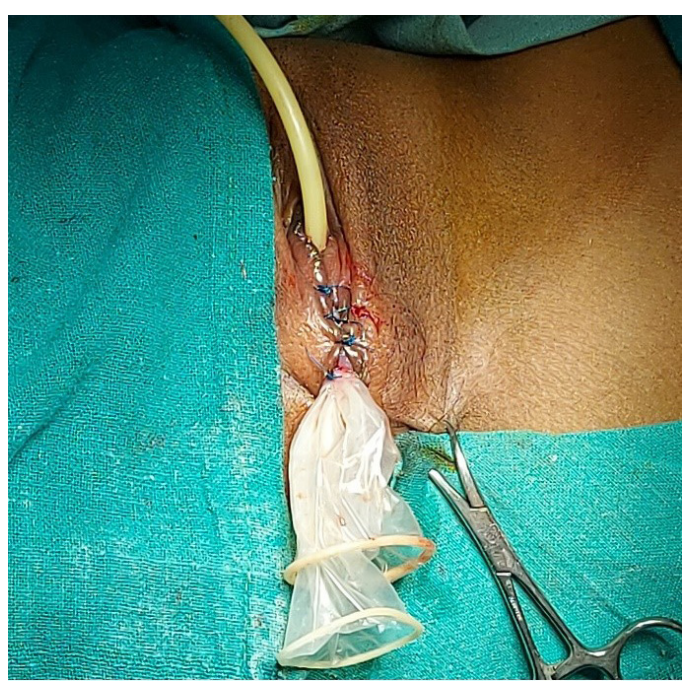
Figure 4:Graft placement over neovagina