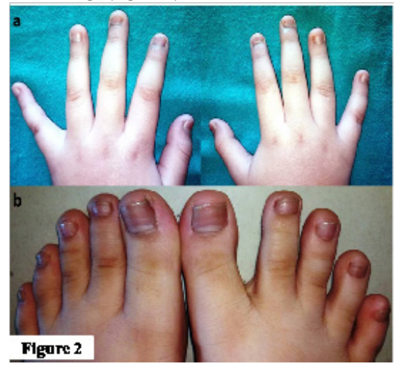
Figure 2: Homogenous pigmentation involving all the fingers and toe nails and nail folds

Remarkable feature was the presence of homogenous pigmentation over his fingernails and toenails, extending and involving even the nail folds thereby exhibiting a pseudo-Hutchinson's sign (Figure 2).