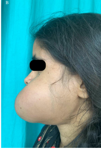
Figure 1: Clinical photographs A Frontal view of lesion of approximately 9x5 cm with normal overlying mucosa. B. Profile view of swelling in the left side.