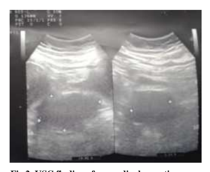
Fig 2: USG finding of appendicular cystic mass.