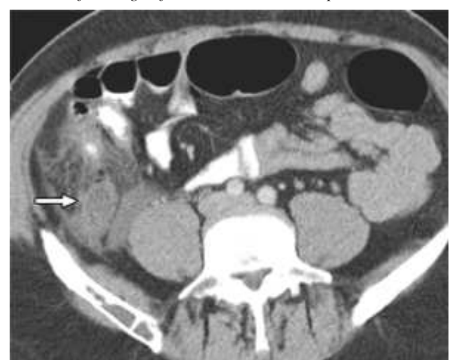
Fig 3: CT-Scan revealed cystic mass.

Journal of College of Medical Sciences-Nepal, 2014, Vol-10, No-2