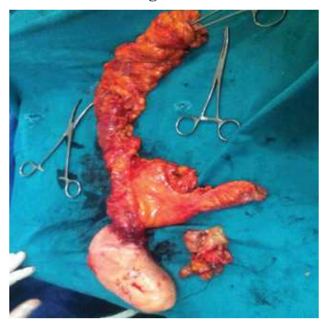
Figure 1. Resected specimen of right hemicolectomy showing appendicular mass.