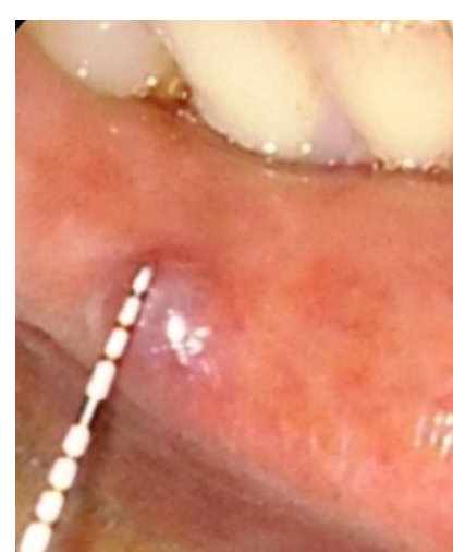
Figure 1 b Figure 1: Pre-operative