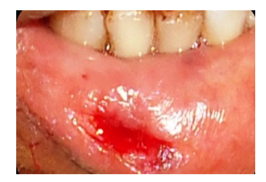
Figure 2: After excision