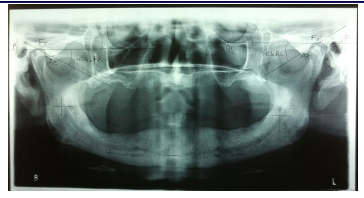
Figure 3: Panoramic radiograph showing tracing of horizontal condylar guidance angle.

Gendex, U.S.A). The images were acquired at (66-84) kVp, (3-15) mA and 12 seconds, according to the built of the patient. Tracings on the radiograph were done using (0.003 inch) acetate tracing paper with an HB pencil 0.3mm (Steadler made, Germany); three reference marks were made to align the tracing paper over the radiograph. A panoramic radiographic image in the temporal region shows the outer radio-opaque line representing the articular eminence and glenoid fossa and inner radio-opaque line representing the inferior border of zygomatic arch.10 The left and right orbitale (Or), lowest point in the margin of the orbit and porion (P), highest point on the auditory meatus were identified. These two reference points were joined by straight line representing the Frankfurt horizontal plane. The most superior point on the glenoid fossa (Fr) and the most inferior point on articular eminence (Ae) were identified and marked. The two reference points (Fr and Ae) were joined by a straight line representing posterior slope of articular eminence. The angles formed by the intersection of two lines: Frankfurt's horizontal plane (P-Or) and posterior slope of articular eminence (Fr-Ae) was measured using protractor to represent the horizontal condylar guidance angle on each side. [Figure 3]