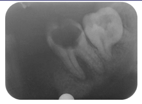
Figure 1: Diagnostic Radiograph