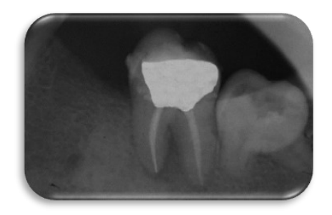
Figure 5: Post-operative radiograph

the Department of Conservative Dentistry and Endodontics with the chief complaint of pain in her lower right back tooth since 1 month. On intraoral examination caries involving pulp was revealed in her right mandibular second molar with tenderness to percussion which required root canal treatment. The diagnostic radiographs (Figure 1) however did not reveal C shaped canal configuration. After giving profound anaesthesia rubber dam was applied and access cavity (Figure 2) was prepared which was deeper than a normal access cavity. After proper orifice enlargement of the root canal C shaped canal configuration was already visualised. Careful initial penetration of canals with size 10 k file (Dentsply) characterised the C shaped canal configuration more accurately. Working length (Figure 3) was determined by placing number 15 k files (Dentsply) of various lengths biomechanical preparation of canals was done using careful circumferential filing method in the presence of large volumes of sodium hypochlorite irrigating solution. The main canals were prepared till file size 35 and the interconnections till number 20 k file. After biomechanical preparation the canals were finally irrigated with chlorhexidine and calcium hydroxide dressing was kept along with temporary restoration. During next appointment after one week the master cone selection was done (Figure 4). The canals were then obturated (Figure