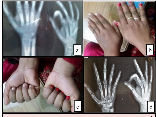
Figure 2. a) Postoperative segmental defect 4<sup>th</sup> metacarpal right reconstructed with tricortical iliac crest graft and fixation with K wire; b) and c) Range of motion at 3 month; d) graft union X ray at 24 month D.

ipsilateral iliac crest. It was used to reconstruct the segmental defect of metacarpal and fixed with K wires. Haemostasis was secured and wound was closed with ulnar gutter slab application. Tissue was sent for histopathological examination and found to be enchondroma. There was no evidence of malignancy such as chondrosarcoma. Slab was removed in 2 weeks and ROM exercise was started.