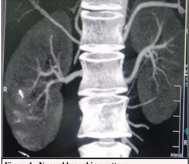
Figure 1. Normal branching pattern.

that the usual branching pattern of renal artery in 70.58% of the individual and remaining 29.41% of