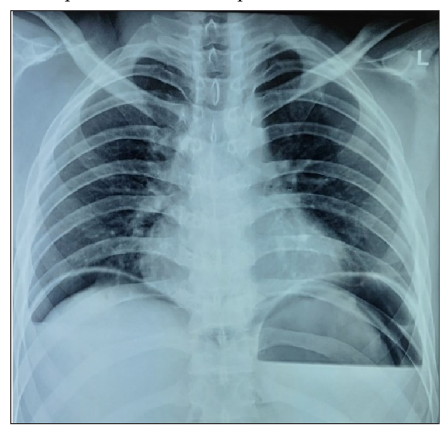
Figure 1. Erect Chest X-ray suggestive of pneumoperitoneum.

bottle was seen intraperitoneally protruding through perforated sigmoid colon. There was a 3x3cm perforation in sigmoid colon through which a 375 ml vodka bottle was protruding half way through with frank peritoneal fecal contamination. The foreign body was extracted and primary repair of sigmoid colon was done. A diverting loop sigmoid colostomy was created and a pelvic drain was kept.