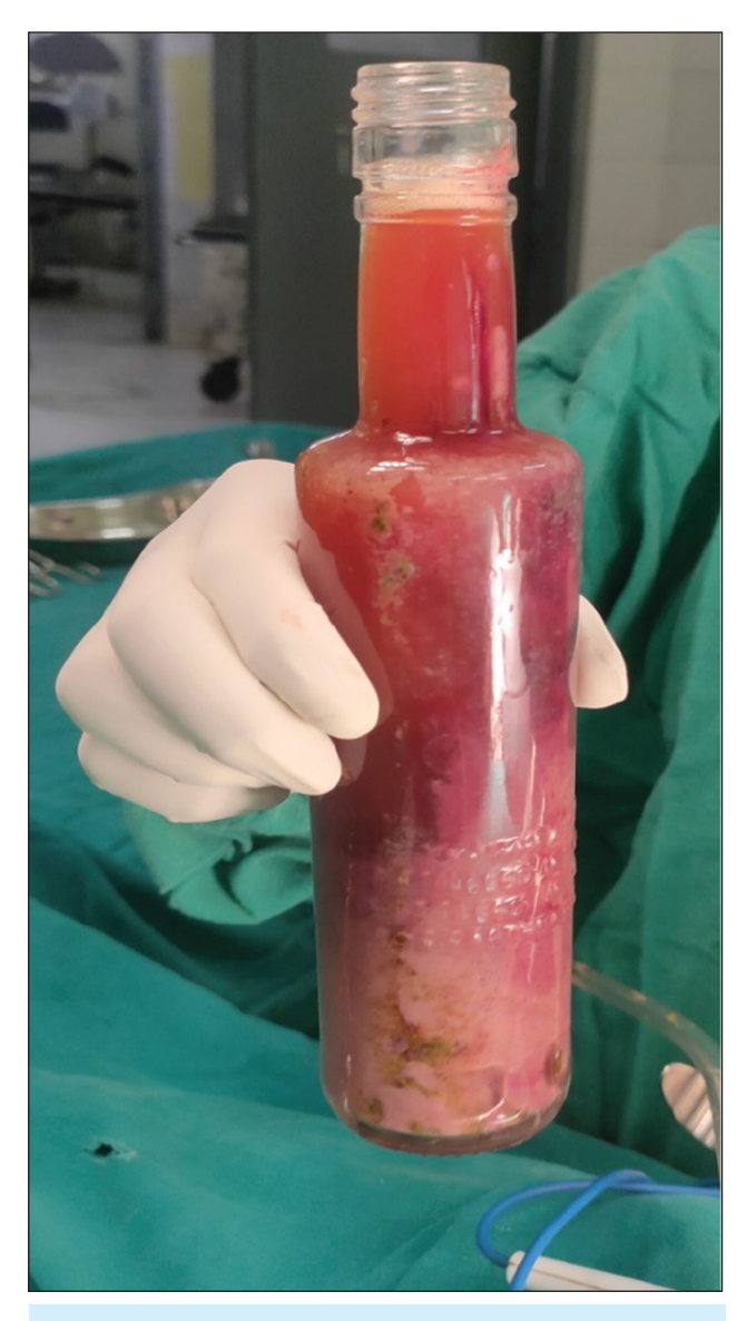
Figure 4. Retrieved foreign body.

Post-operatively patient developed superficial incisional surgical site infection and pneumonia which was managed accordingly. Drain was removed on post-operative day 7. Patient was discharged on post-operative day 22.