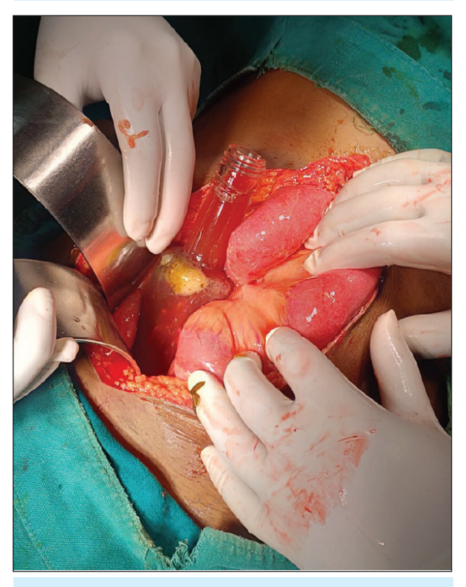
Figure 4. Laparotomy finding: vodka bottle inside peritoneal cavity.