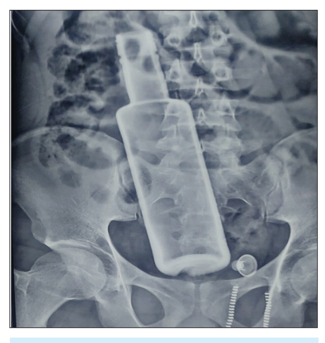
Figure 2. Abdominal X-ray suggestive of bottle inside the abdomen.