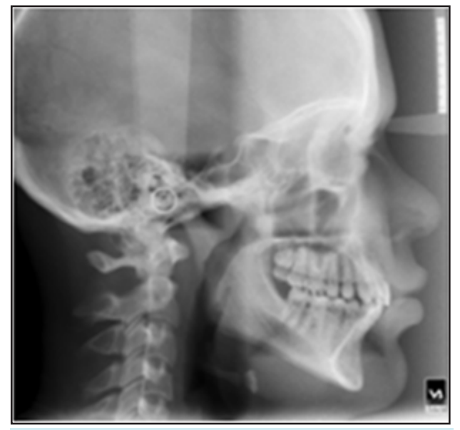
Figure 6. The superimposition of pre- and postlateral cephalogram of a patient with a vertical growth pattern.

cal growers, which was not significant(P=0.10). Significant anterior movement of the mandibular base (N perpendicular to pog) was observed in