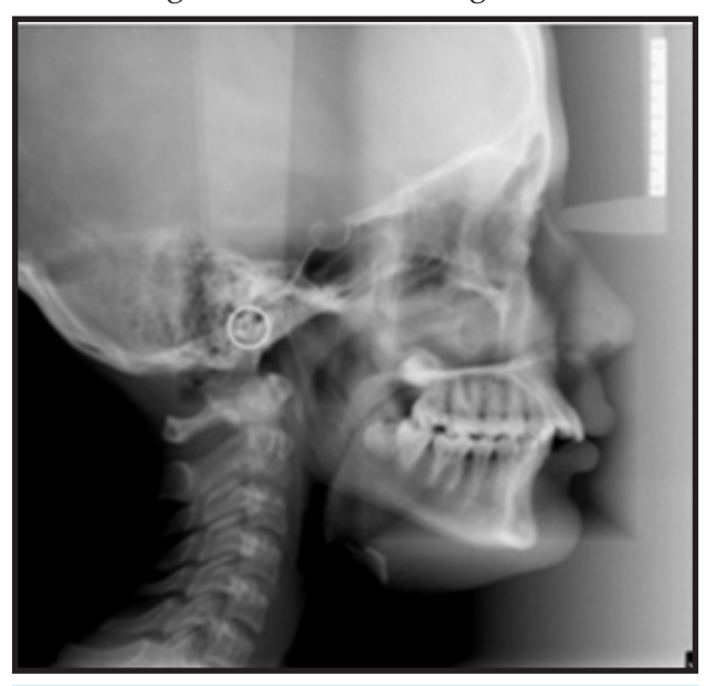
Figure 1. Pre treatment lateral cephalogram of patient with horizontal growth pattern.

The superimposition of pre and post-treatment lateral cephalogram of horizontal grower is shown in (Figure 3).