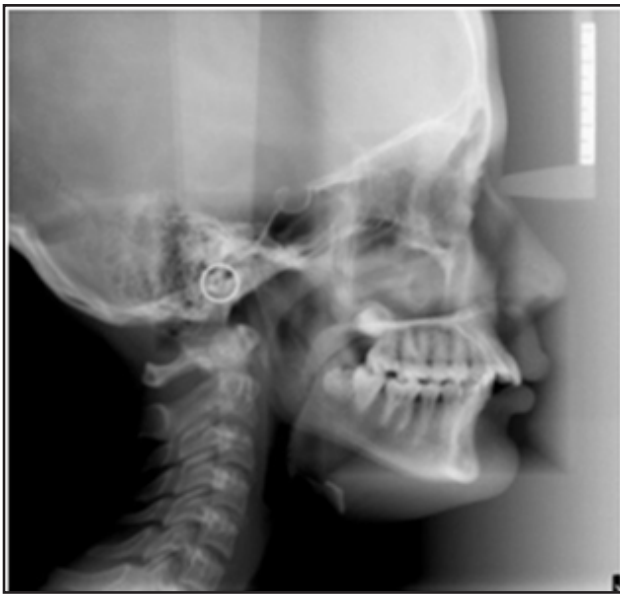
in (Figure 6).

Figure 4. Pre-treatment cephalogram of patient with vertical growth pattern.