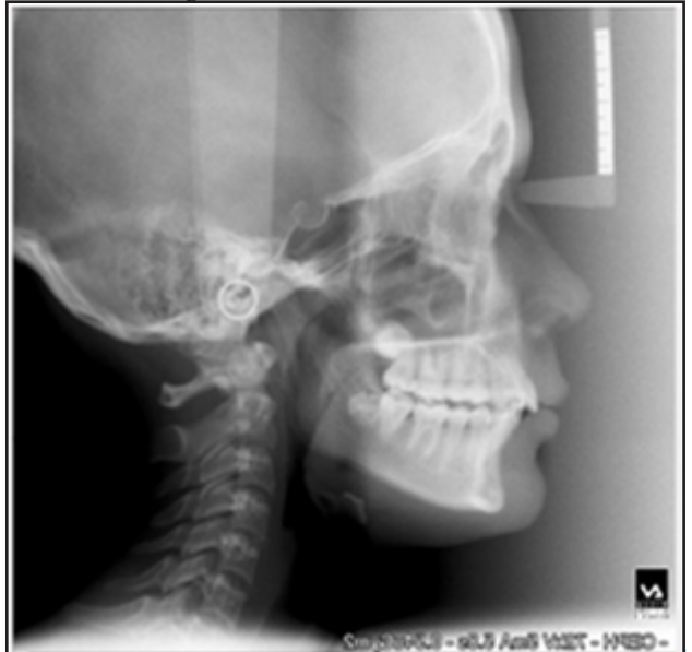
Figure 2. Post treatment lateral cephalogram of patient with horizontal growth pattern.

The superimposition of pre and post-treatment lateral cephalogram of horizontal grower is shown in (Figure 3).