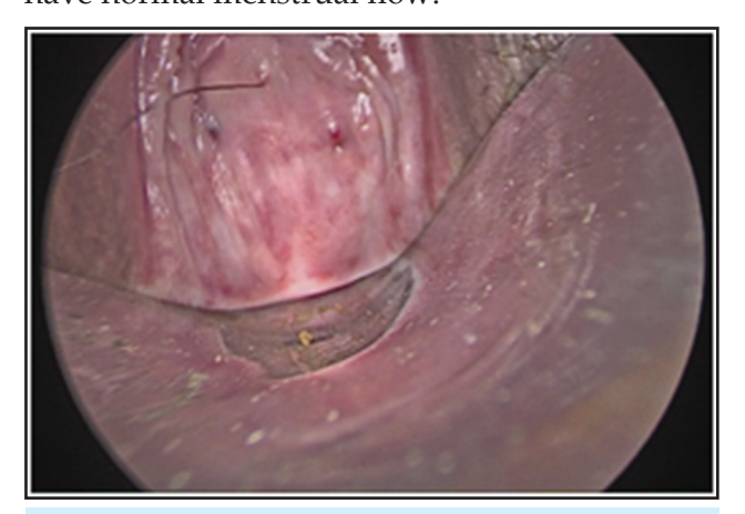
Figure 1. Micro perforation in the vagina with transverse vaginal septum.

in a couple. Her baseline blood investigations were normal. On per speculum examination, vagina was completely obstructed about 2 cm from the hymen with a pinpoint opening in the septa, and on per rectal examination, a firm globular structure was felt which was thought to be cervix. Magnetic Resonance Imaging (MRI) revealed right hydrosalpinx with hemorrhagic cyst in left ovary, with normally appearing cervix and cervical canal. She underwent examination under anesthesia together with diagnostic laparoscopy and hysteroscopy. Intraoperatively, thick transverse septum was noted with micro perforation, (Fig 1) vaginally hydrodissection was done and transverse incision was given followed by dilation until cervix was reached. Diagnostic laparoscopy revealed bulky bilateral ovaries with right hydrosalpinx and hemorrhagic cyst in left ovary. (Fig 2) Right salphingectomy with drainage of fluid from right ovarian hemorrhagic cyst along with bilateral ovarian drilling was done. On hysteroscopic evaluation, endometrial cavity was normal with B/L ostia visualized. (Fig 3) Tubal patency was checked with methylene blue which was negative for both tubes. Vaginal mould was kept and patient was taught about the proper use of mould and self-dilatation procedure and was discharged on 6th postoperative day. During follow up, no vaginal strictures or infection was found the have normal menstrual flow.