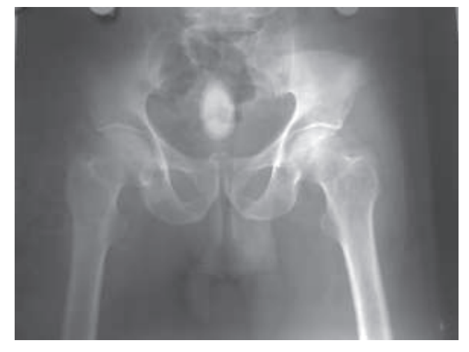
Figure 2: Radiographic view of the calculus.