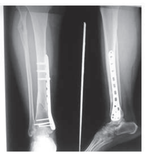
Fig. 2d - Follow up x ray of 24 weeks

MIPPO technique reduces the iatrogenic soft tissue injury and damage to the vascularity of bone as well as preserves the osteogenic fracture haematoma which is essential to prevent the potentially severe complications.<sup>17</sup> The infection