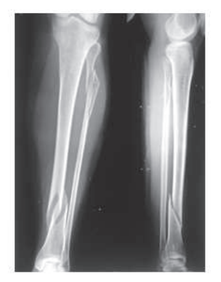
Fig. 2a - Preoperative x ray