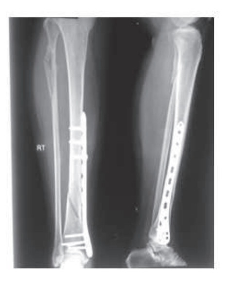
Fig. 2b - Immediate Post up x ray