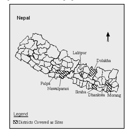
Figure 1 Districts belonging to the sites

Gagan Khola CFUG is located in Siraha District of the Eastern Terai Region of Nepal. One of the reasons for interest in this CFUG was that it has received a prestigious conservation award (Ganeshman Vatabaran Samrachhan Puraskar) in 1998. However, dalits of the CFUG were economically and socio-culturally suffering from the actions taken by the higher castes and economically advantaged members of the community. We referred to the process applied in the CFUG as "Self-Monitoring" and this approach was applied during the period of 2003-2004.