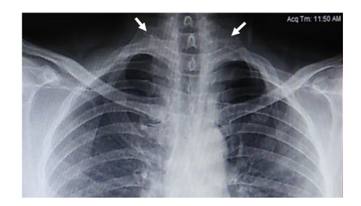
Figure 2: Radiograph of thoracic region (PA view) showing