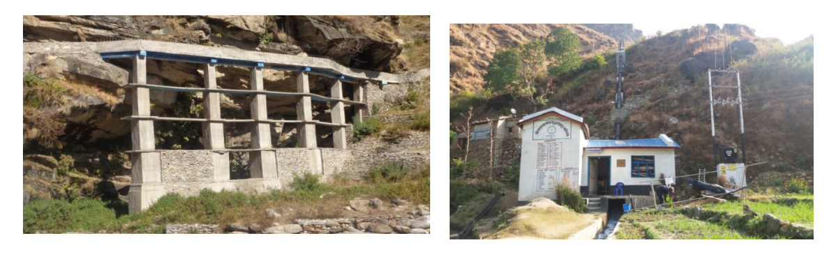
Headrace Canal of Project