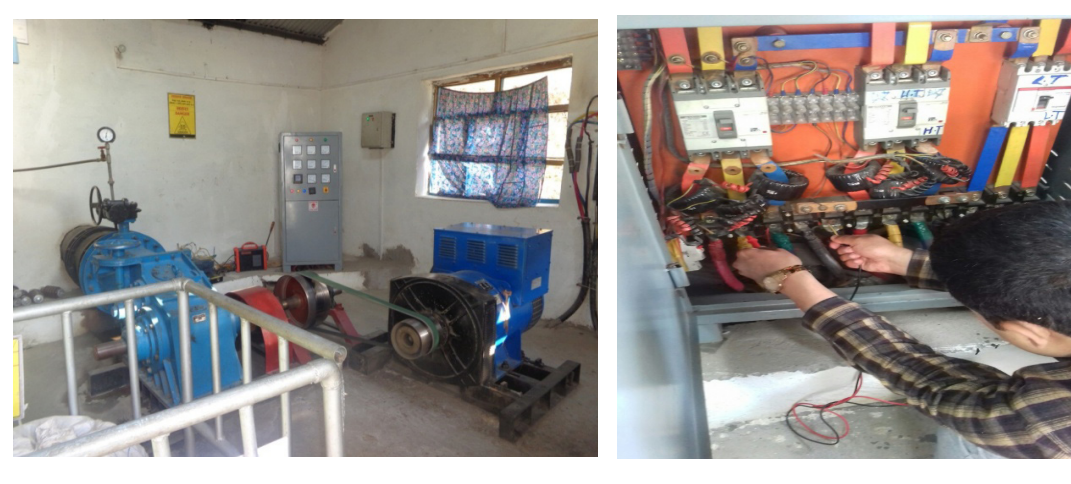
EM Parts inside Power House