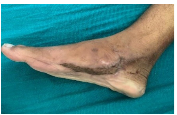
Fig 4. Clinical photograph at 3 years follow-up showing normal looking plantigrade foot