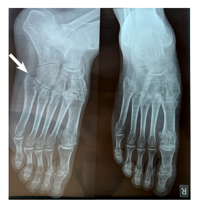
Fig 3. X-ray at 3 years followup showing well-reduced Lisfranc Joint with no features of arthritis

At 3 years follow-up the American Orthopedic Foot and Ankle Society (AOFAS) midfoot score was 100, with only occasional morning stiffness in foot lasting for a few minutes (Figure 3,4). The patient has rejoined his previous profession of policeman requiring prolonged walking and walking on uneven surfaces.