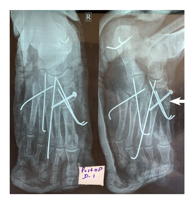
Fig 2. Post-operative X-ray showing well-reduced Lisfranc joint

metatarsals to the cuboid each. The heel flap was fixed to the calcaneum with two K-wires. (Figure 2) The open wound on the medial side of the foot was loosely closed. There was no infection in the wound. After development of the granulation tissue, skin graft was done. Post-operative slab support was applied. K-wires were removed after 3 months and weight bearing was started. The screw was removed 4 months post-operatively.