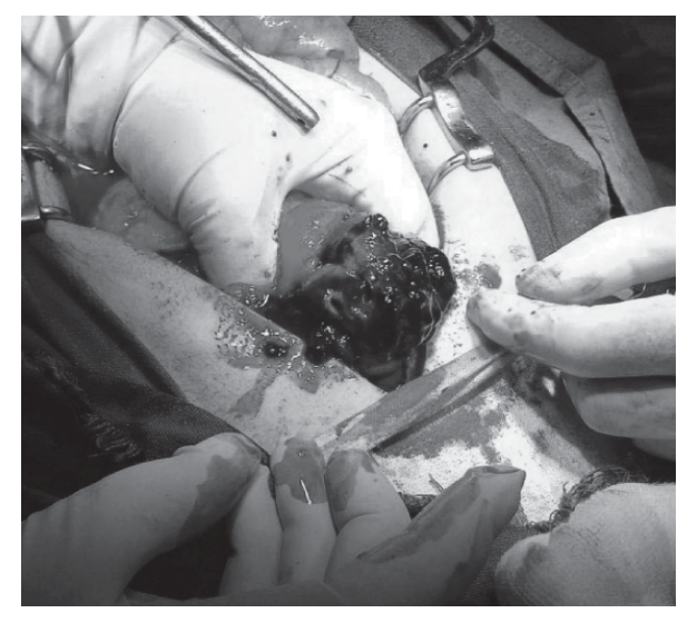
Fig. 4: Blood clot in the aneurysm

Intraoperative bleeding was not extensive which could be attributed to previous embolization of the major feeding vessel (Fig. 4). Pancreatic resection was not done as it would be a major surgical procedure around a dense adhesion in a young unstable patient. The surgical treatment of the patients should be individualized. Location of a pseudoaneurysm is a major issue when selecting surgical options. Distal pancreatectomy and splenectomy should be employed to treat bleeding lesions located in the pancreatic tail as these procedures have low morbidity and mortality.10 Pancreaticoduodenectomy should be limited to selected situations for which less invasive procedures are not technically feasible.<sup>11,12</sup> Favorable result has been reported in two-thirds of patients when the operative strategy was control of bleeding and removal of the affected pancreatic segment.<sup>4</sup> Reported success rate of surgical intervention is up to 89%.3