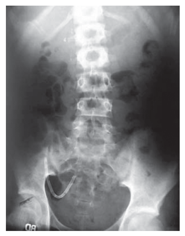
Fig. 1: Abdomen X ray showing calcification on pancreas and stent in right iliac fossa