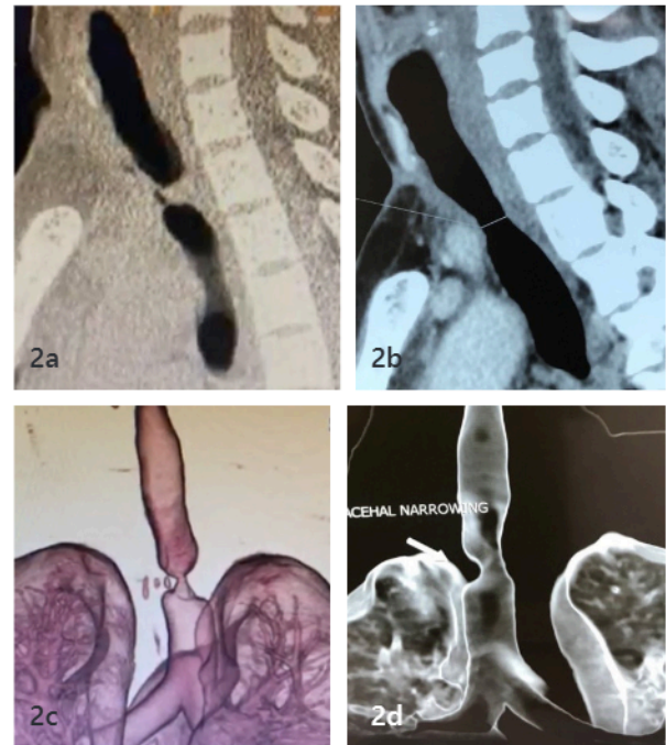
Figure 2. CT scans of the patient. 2a, 2c pre-Laser images with severely stenosed, irregular trachea at the level of D1 vertebra and 2b, 2d post-Laser with partly opened

Unfortunately, the patient developed stridor again after 3 weeks. The culprit was found to be a shelf-like narrowing, and hence a decision was taken to ablate it with Laser. A total of 0.8 KJ of Nd:YAG Laser was used in 22 pulses at a power setting of 15-20 W, in continuous mode, via a flexible bronchoscope inserted via a rigid one, with all anesthetic precautions. Care was taken to align the lasing fibre as parallel to the tracheal wall as possible. (Fig 3) The desiccated tissue was debrided