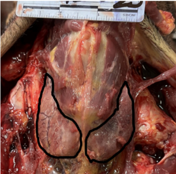
Figure 3. Absence of isthmus.

was found to be 17.46 g (SD= 5.04). The difference was found to be statistically significant on Mann Whitney U test ( p -value<0.001).