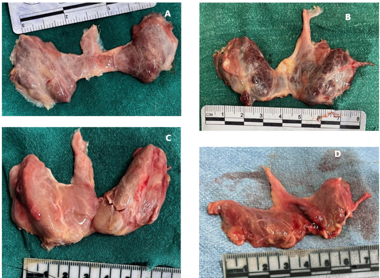
Figure 2. Different origins of pyramidal lobe (A: central, B: towards right lobe, C: towards left lobe), presence of levator glandulae thyroideae (D).