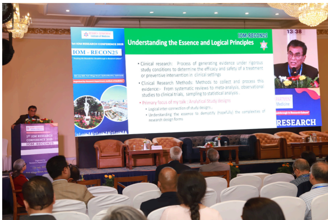
Figure 5. Invited lecture by Prof. Mahesh Maskey on "Demystifying clinical research method"