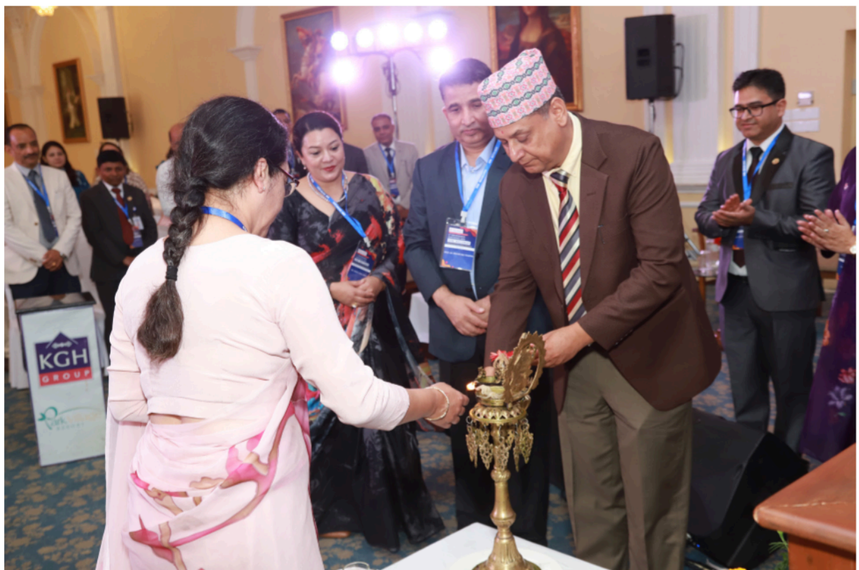
Figure 2. Inauguration of IOM-RECON25 by Prof. Deepak Aryal, Vice Chancellor of TU by lighting of panas