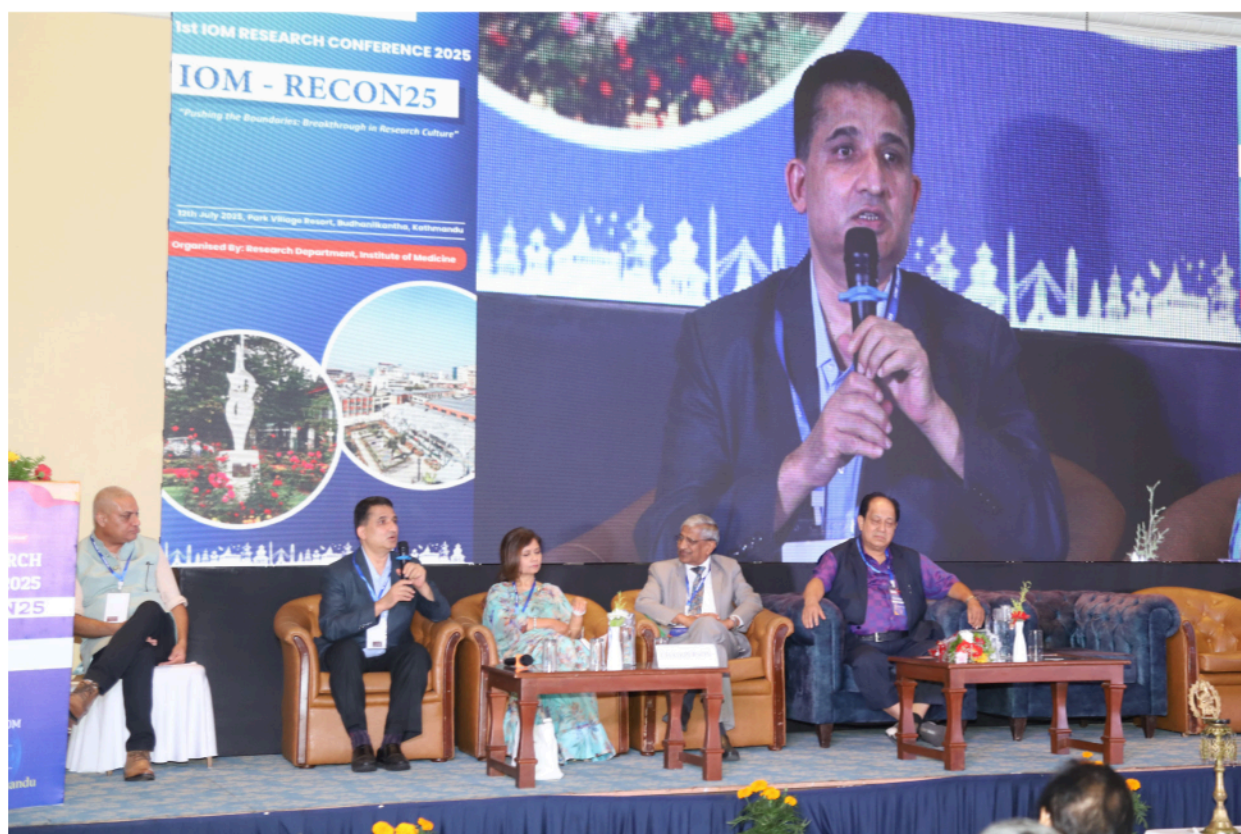
Figure 4. Panel discussion on "Progress of medical education and research in the 53 years' history of IOM"