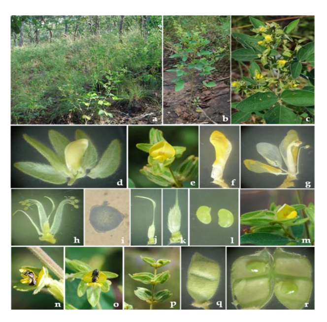
Fig. 4. Rhynchosia heynei: a. Habitat, b. Individual plant in flowering, c. Flowering branches, d. Mature bud, e. Flower, f. Keel and wing petals, g. Keel and wing petals together with released stamens and stigma, h. Gynoecium enclosed in the staminal sheath, i. Pollen grain, J. Ovary, style and stigma, k. Ovary with hairy surface, l. Ovules, m. Partially closed flower, n. Ceratina sp., o. Halictus sp., p. Fruits with persistent calyx, q. & r. Fruits with 2 seeds.