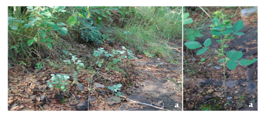
Fig. 5. Rhynchosia heynei: a. & b. Seed germination and seedling establishment.