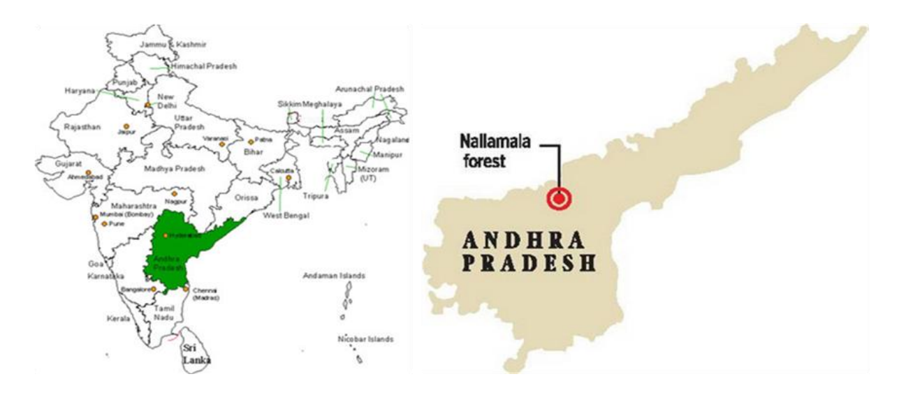
Fig. 1. Map showing study area in Andhra Pradesh, India.