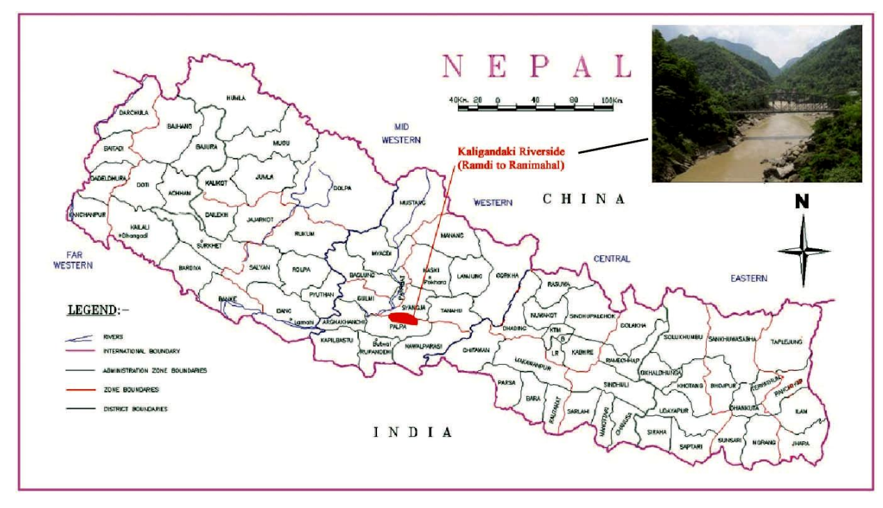
Fig. 1. Location of study area (Ramdi area) in the map of Nepal

selected from the people living around the Ramdi area for this study. The pre-set questionnaires formats were used to get the information on human-monkey conflicts. The respondents were interviewed separately to ensure the independence of the individual response. To minimize the bias, questions were asked to the villagers on the expected production of crops without crop raiding and the amounts of crops after raiding. The data were compiled together and calculated in terms of percentages.