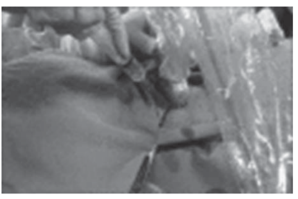
Figure 2: The ultrasound guided in internal jugular vein puncture