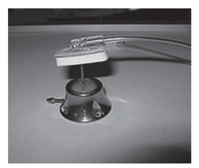
Figure 4: Titanium chemoport