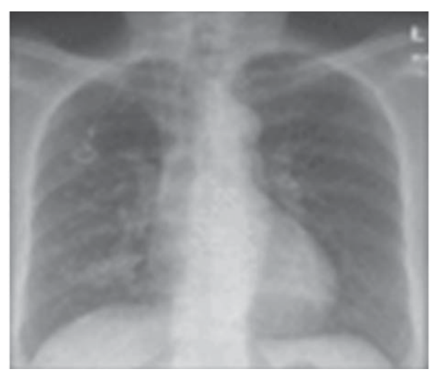
Figure 3: Postprocedural chest X-ray