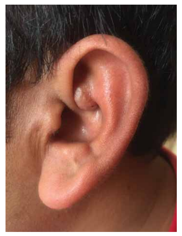
Figure 1: Mass in left pinna

surgery<sup>4</sup>. Microscopy shows proliferation of schwann cells in two histological patterns of Antoni A and Antoni B. It shows closely packed cells with small spindle shaped and densely stained nuclei with whirled verocay bodies in Antoni A. Whereas in Antoni B, tissue is loosely arranged stroma in which the fibres and cells form no distinct pattern. The two types may also be mixed<sup>8</sup>.