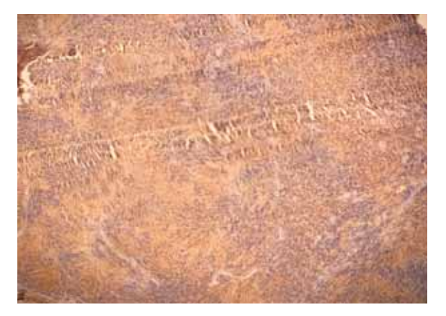
Figure 4: 10X: S-100 positive