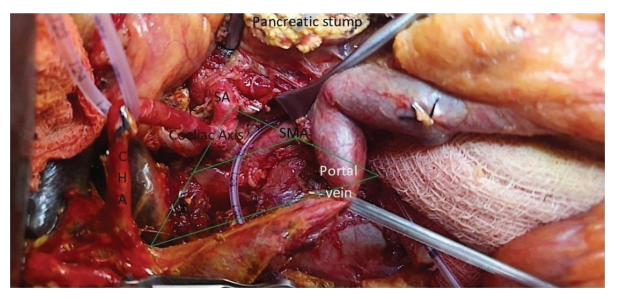
Figure 3: After clearance of apical tissue around Superior Mesenteric artery (SMA) and Coeliac axis(CA). CHA: Common hepatic artery; SA: Splenic artery; SMA: Superior mesenteric artery.