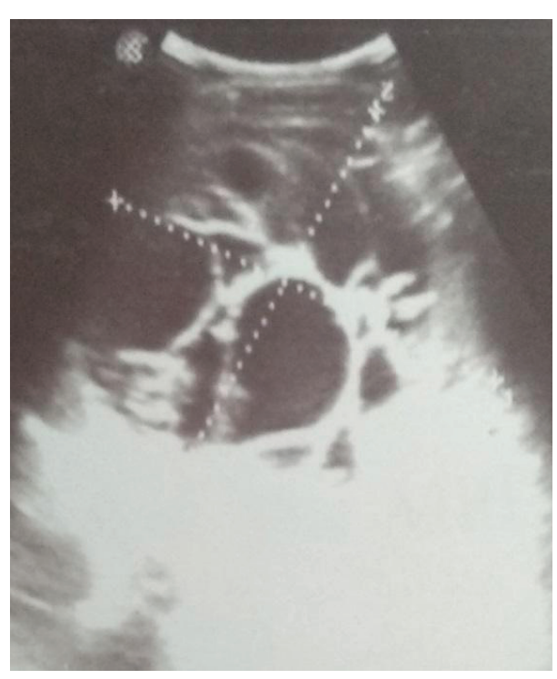
Figure 1: Sonological finding of complex cystic lesion with multiple internal septations in right kidney

epithelium. Immunohistochemistry done with Vimectin and Pancytceratin were positive for both. The features were conclusive for Cystic Partially Differentiated Nephroblastoma with ureteric margin, renal hilum, a perirenal sinus, and lymphnodes free of the tumour (Figure 3a, 3b, 3c).