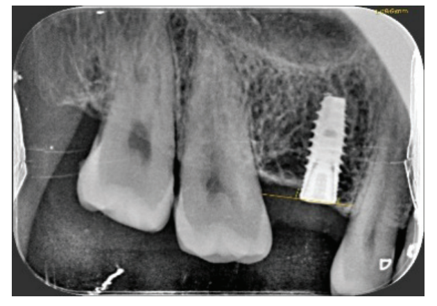
Figure 1: Bone level at implant placement