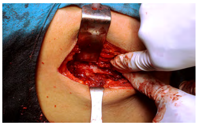
Fig 4: Per operative findings showing cartilaginous cap in the lesion