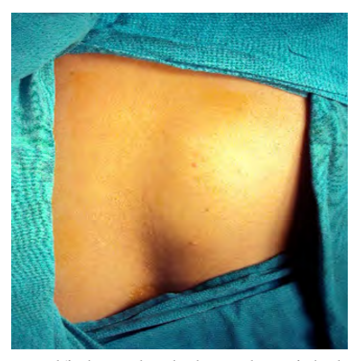
Fig 1: A diffuse lump over lower dorsal paraspinal region of right side