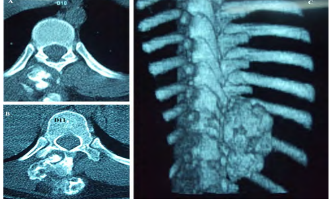
Fig 3: CT scan at the level of T10-11 showing an abnormal bony mass arising from the posterior arch of T11 having irregular cortical margins (A and B). The 3D CT reconstruction of this patient shows the osteochondroma of T11 vertebra comes from the spinous process (C)

from the spinous process (Fig. 3C). Excision biopsy of the tumor was planned.