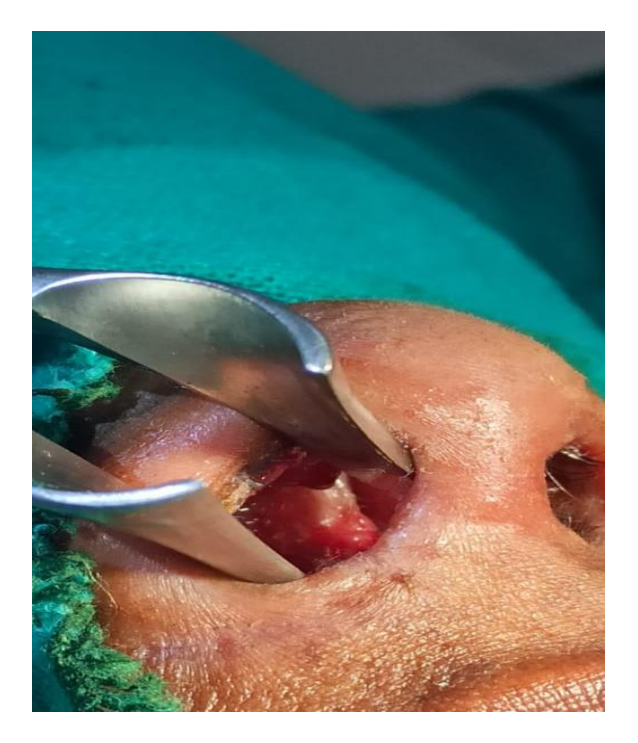
Figure 1: Nasal examination showing septal perforation with crusting

respiratory tract infection. There was also no evidence of fever, cough, headache, fatigue, or bodyweight loss. There was no history of tuberculosis (TB), diabetes, hypertension, asthma in the past. The patient denied any addiction or history of drug allergy. There appeared to be no abnormality upon external nasal and neck examination. On nasal examination revealed a septal perforation about 1.5cm in diameter, with marginal brownish crusting over the anterior one-third of the nasal septal cartilage (Figure 1).